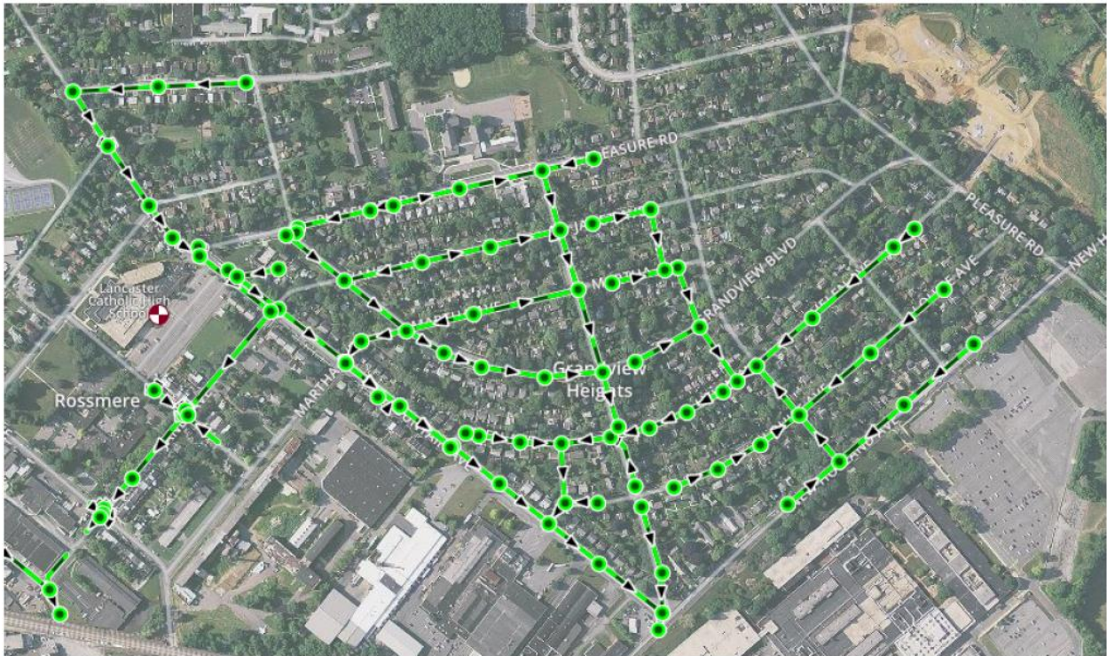
Figure 2. Survey Area Map